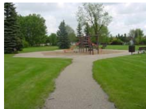
Lt. Gen. G.G. Simonds Park